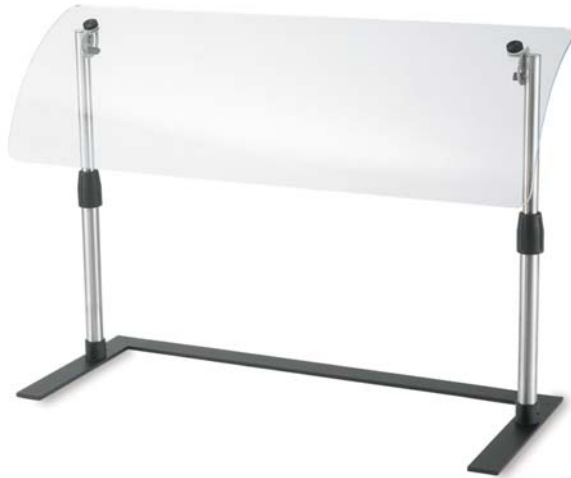
Mobile Breath Guards